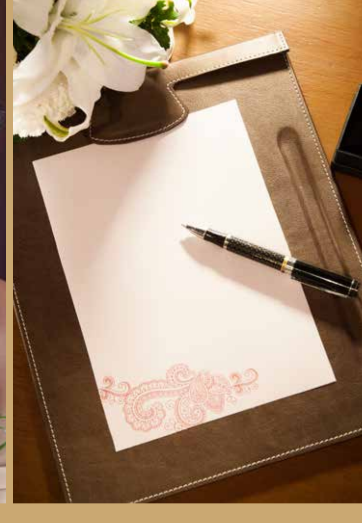
Original: The Night Before

For an exceptional celebration, Anantara will create a cocktail the night before. Tailor made to each couple's personality, favourite colour, liquor level and taste; it's a delectable drink to personalise the wedding day.