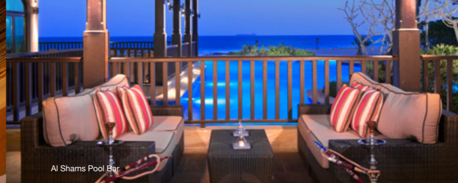
Al Shams Pool Bar