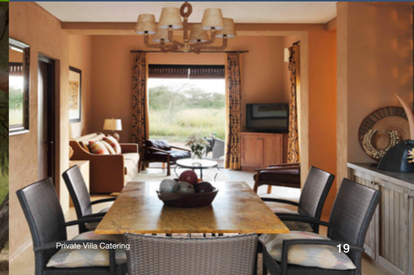
Private Villa Catering