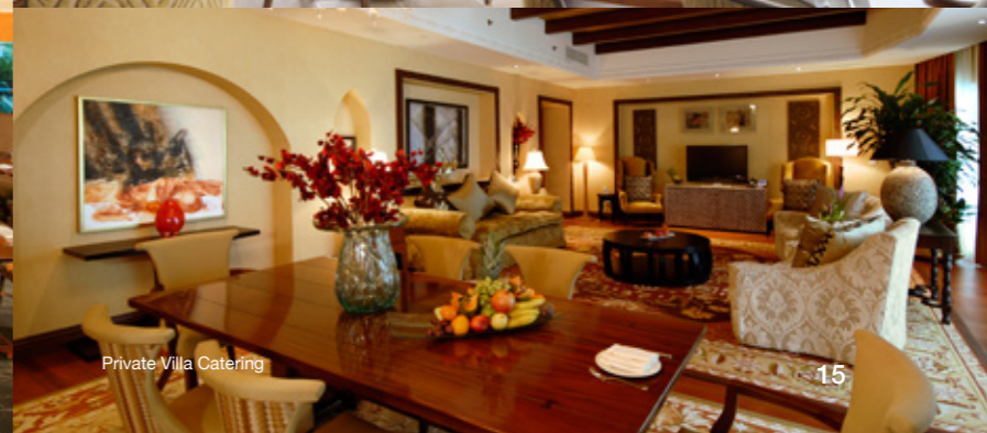
Private Villa Catering