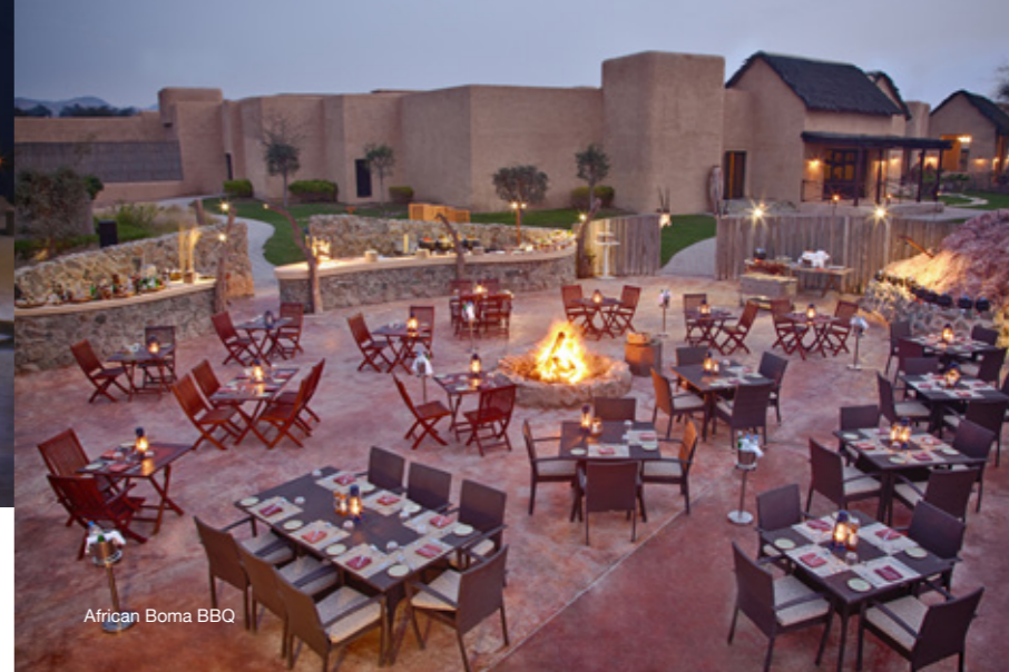
African Boma BBQ

Savour tempting flavors of the Mediterranean cuisine, while soaking in the views of Al Yamm Villa's shimmering shoreline. As scrumptious dishes are prepared at our live cooking stations and succulent grills sizzle on the BBQ, chill-out music complements the soothing sound of the sea on Sir Bani Yas' eastern shores.