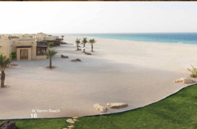
Al Yamm Beach