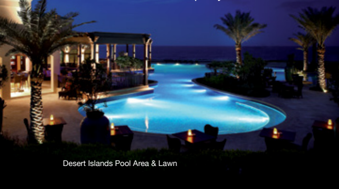
Desert Islands Pool Area & Lawn

Desert Islands Resort & Spa by Anantara.