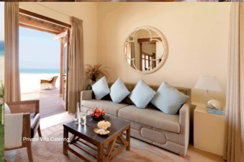
Private Villa Catering