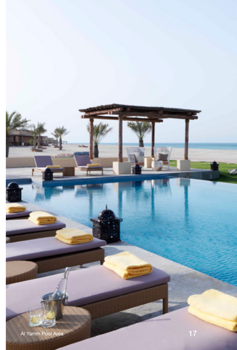
Al Yamm Pool Area

Gather outdoors by the poolside, while the fresh island breeze streams through your hair and you savour your favourite wines and cocktails.