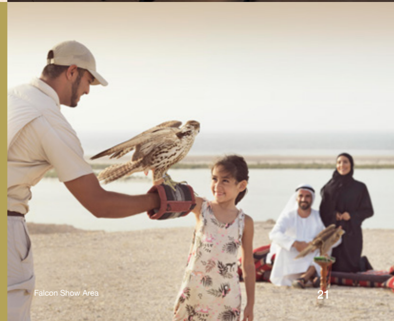
Falcon Show Area

Located on top of one of Sir Bani Yas Island's natural salt mountains, this venue offers views over the Desert Islands lagoon and the Arabian Gulf beyond.