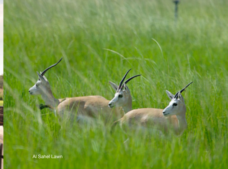
Al Sahel Lawn