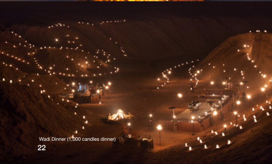
Wadi Dinner (1,000 candles dinner)