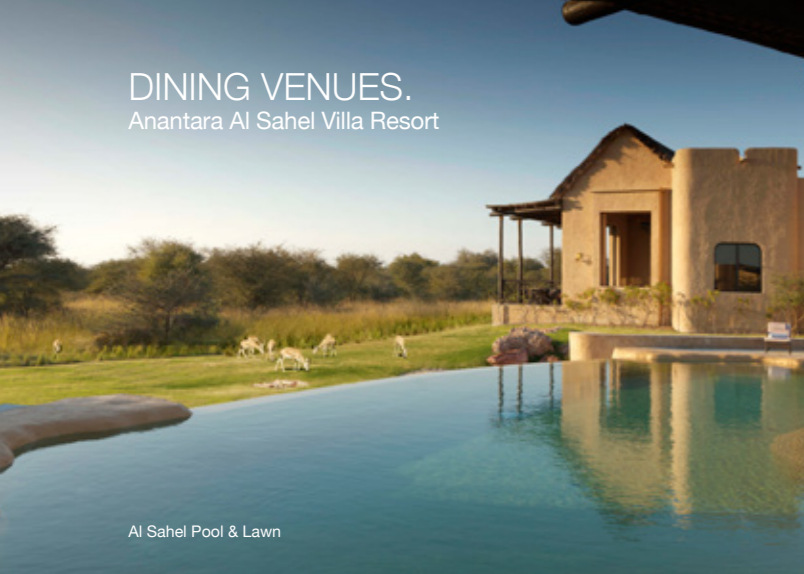
Al Sahel Pool & Lawn