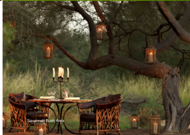
Savannah Bush Area

Savour delicious delicacies from the African continent. Relax and let the majestic surrounds of the grassland enthrall you.